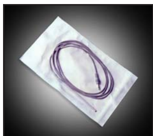
Single-Use (VDP-8 8 MHz)