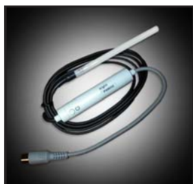
Pencil Probe (P8M05S8A 8 MHz) * also available in 5 & 10 MHz)

Web based training available for unlimited access to on-demand training & support